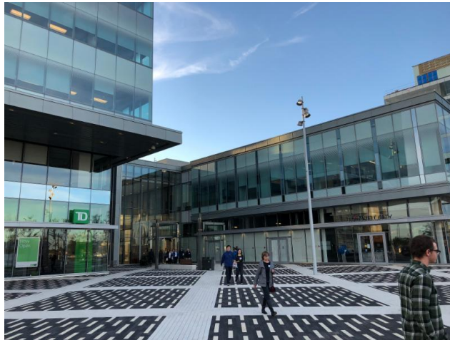
Transit square in front of the KPMG building

Moving through transit square and on to the VMC subway station, York Region Transit (YRT) and York Region Rapid Transit Corporation (YRRTC) provided context on transit infrastructure in the area, including the VIVA Rapidway on Highway 7 and link to VMC station, and the SmartCentres Place Bus Terminal on the north side of the site where construction continues.