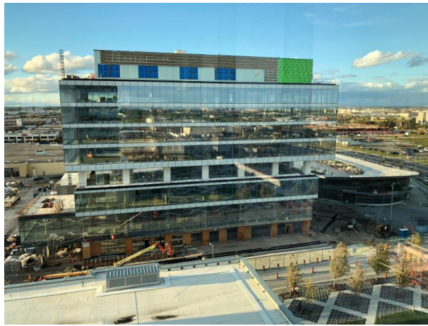
Future office space with a YMCA and public library